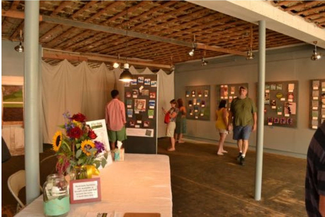
Art is a great way to move help heal trauma - the Floodgates Art Exhibit created by the victims of Tropical Storm Irene