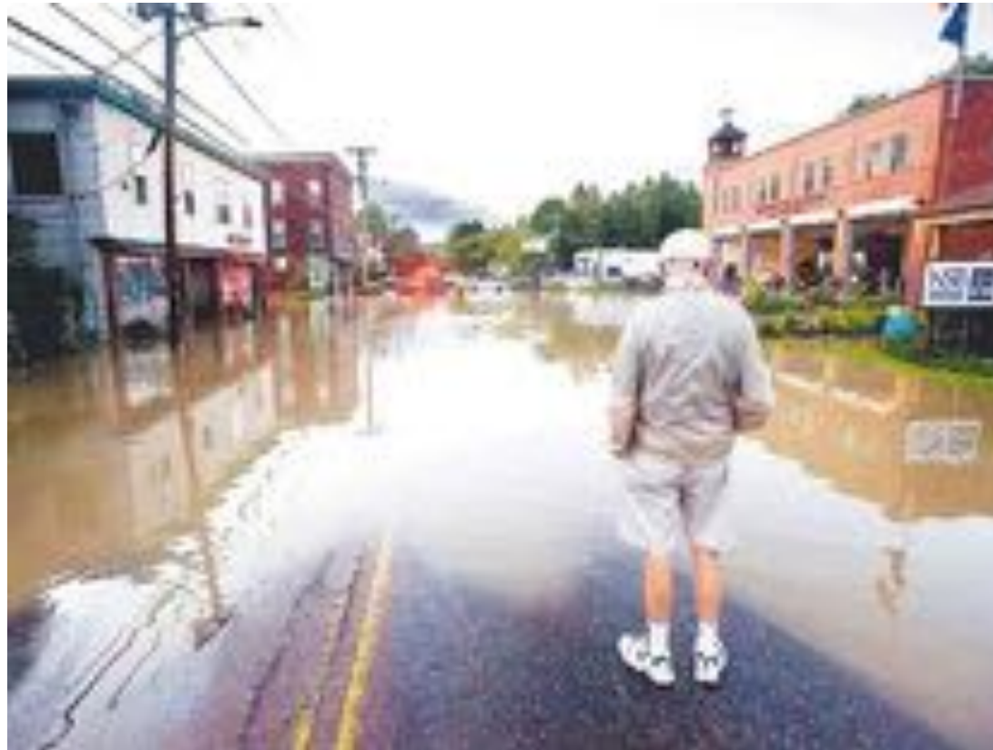
S. Main St. in Waterbury, August 29, 2011