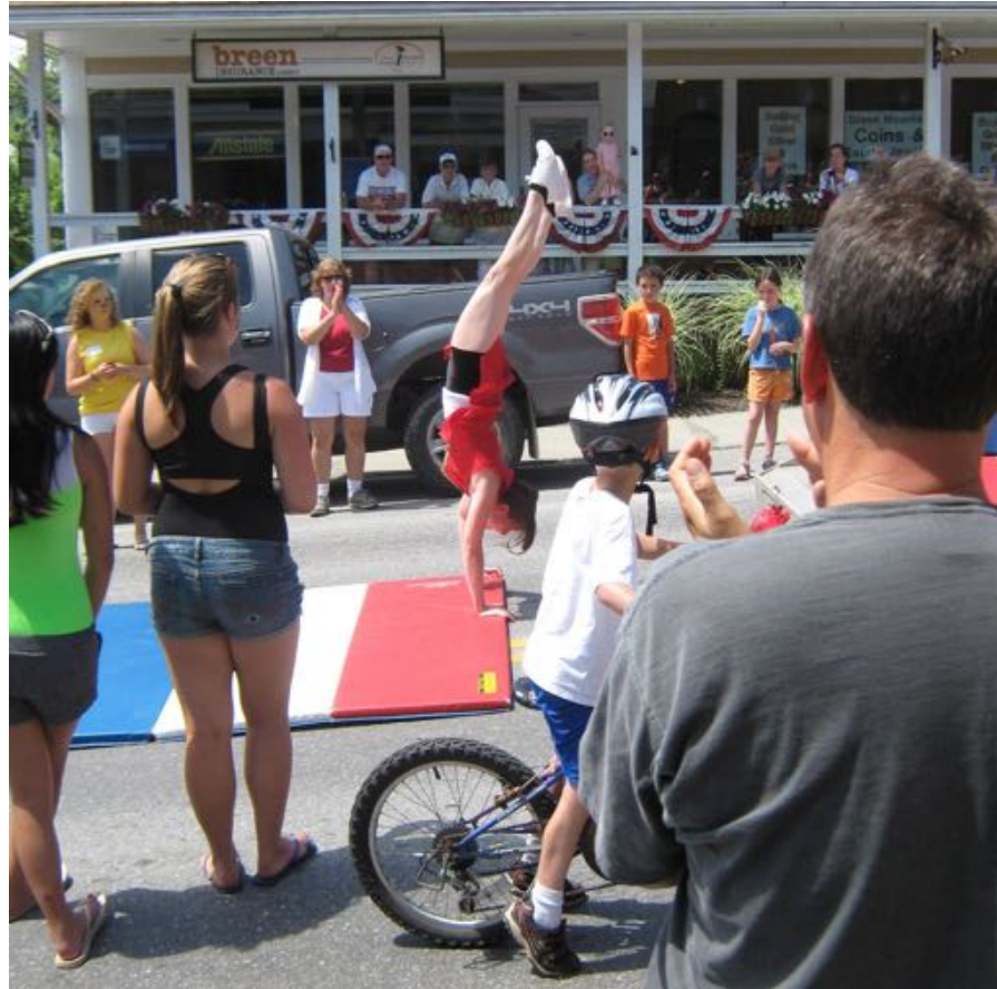
The “Not Quite 4 th of July” Parade & Celebration