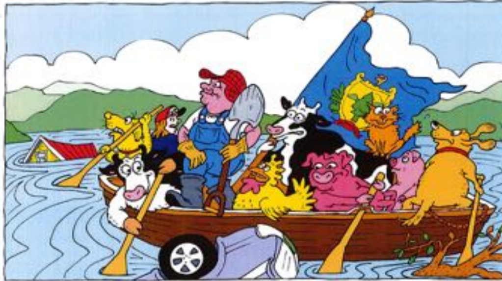
Waterbury artist Sarah-Lee Terrat's rendition of Washington Crossing the Delaware; Washington County Crossing Main Street during Tropical Storm Irene.