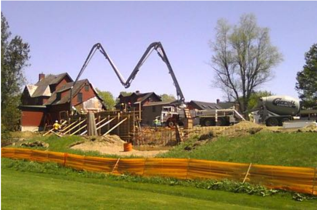
The new Municipal Complex under construction at the site of the historic Janes House – summer, 2015