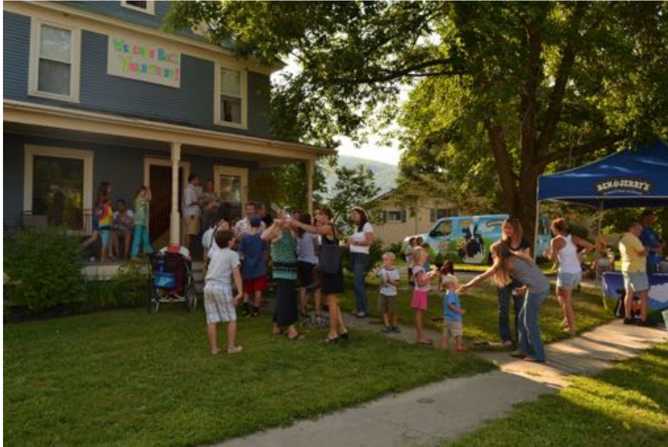
Celebrate successes with gratitude - the Thank You Party for the volunteers on Randall St. after the houses were renovated