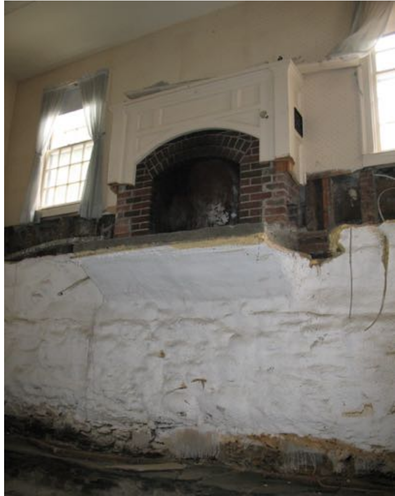
The former front office of the Municipal Office Building